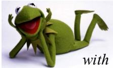
with her mascot Kermit the Frog