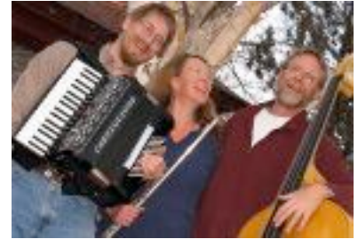
Bandage à Trois from Idaho & Utah